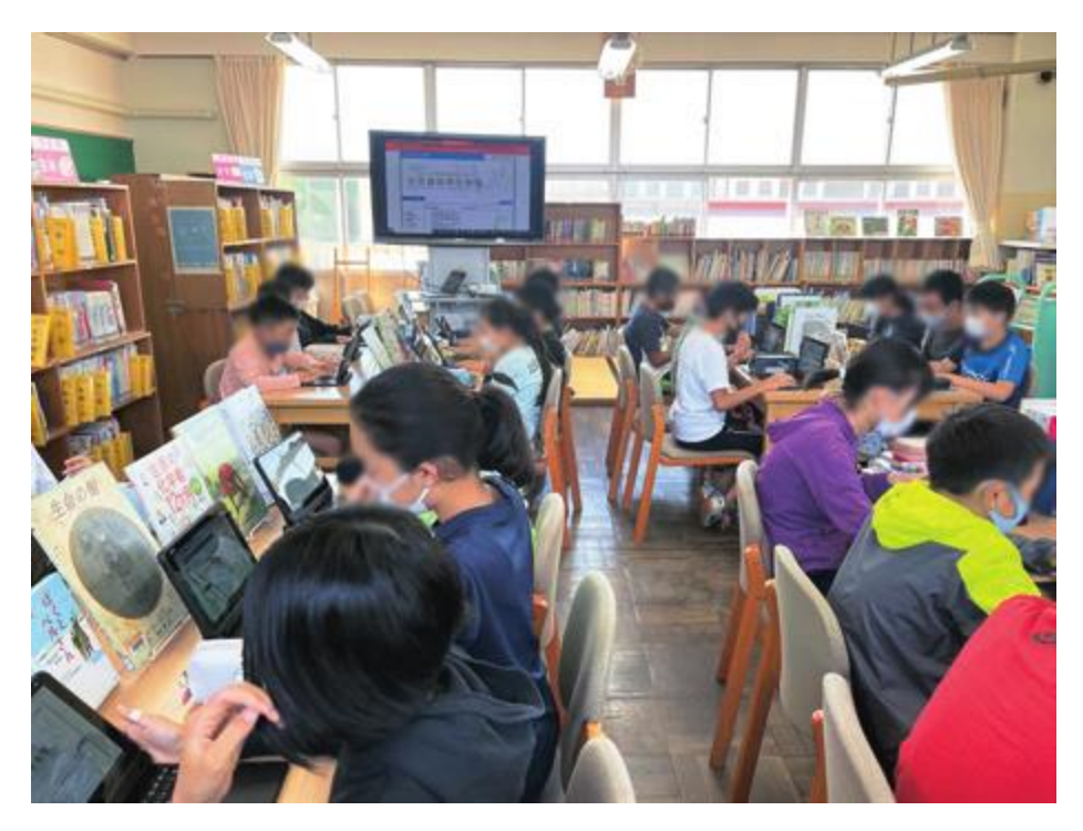
Figure 2: Elementary school children using SORAN to learn about local heritage